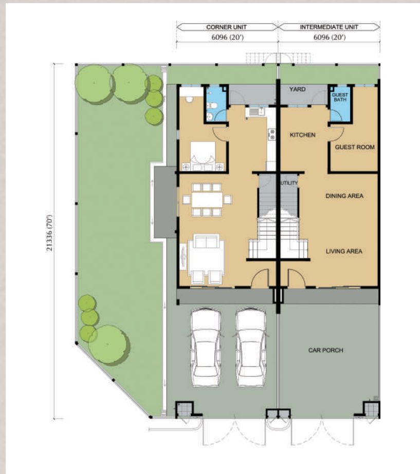
Phase 2 | Ground Floor Plan