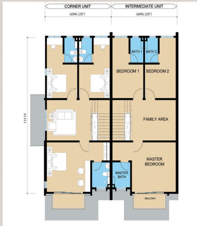
Phase 2 | First Floor Plan